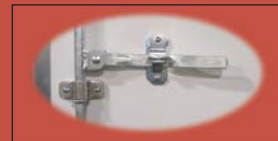
Door Hardware HT144