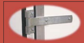
Rear Hinge HT144