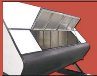
Front Access Door