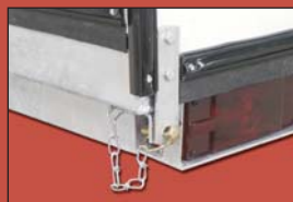
Rear Pin System