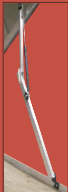
Hinged Support Arm with Gas Shock